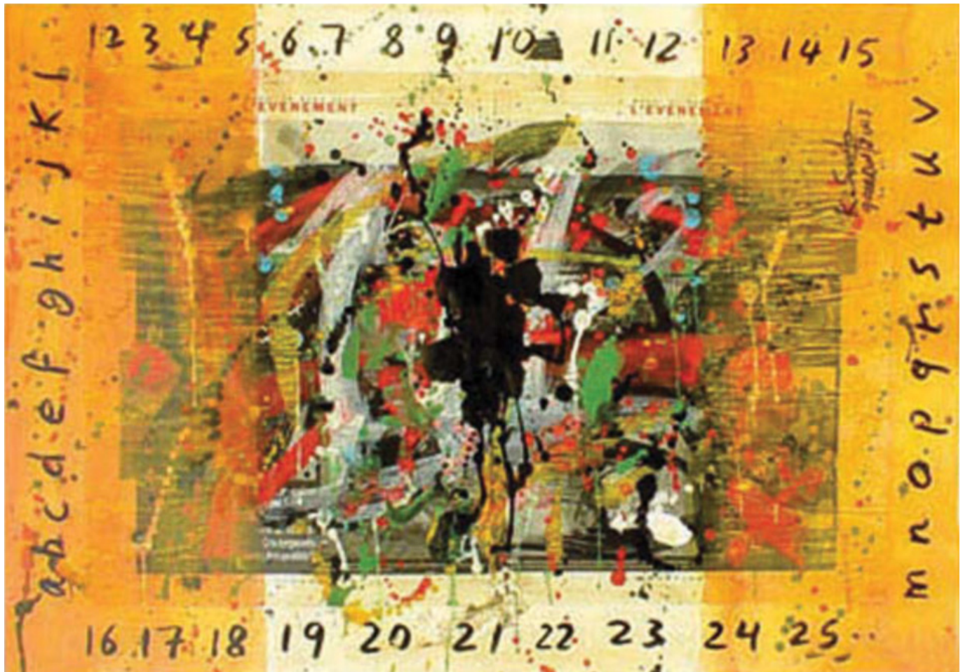
Karim Saifou (Iraq), Baghdad the Day After , 2003.