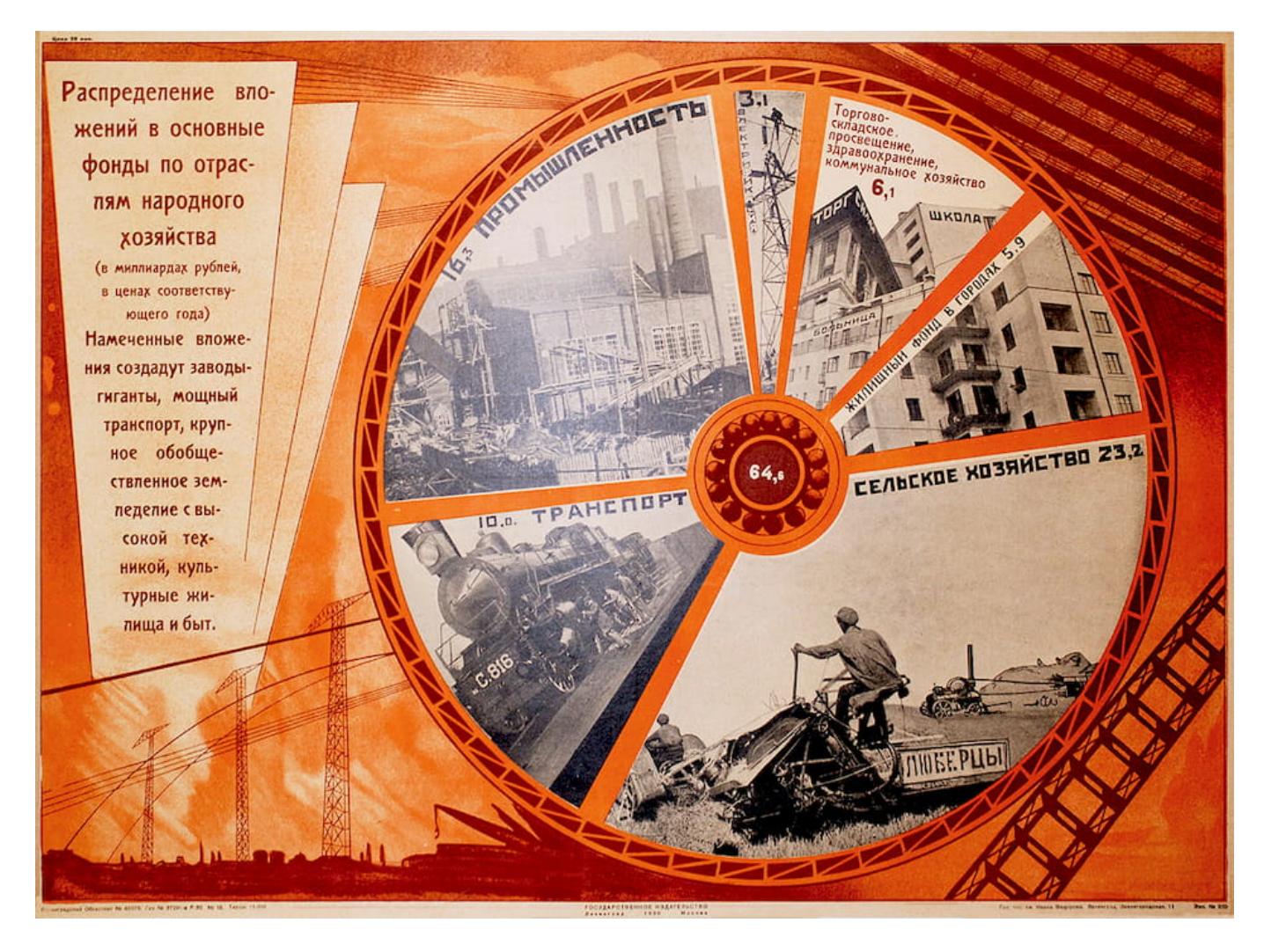
Lithograph to illustrate the distribution of the Soviet budget, 1930.

Mobilise the population. Health care could not be left in the hands of the doctors and nurses alone; Semashko made the case for the mobilisation of workers and peasants into the struggle to build a healthy society. The Workers' Committees to Combat Epidemics were established in 1918 in both cities and villages; the representatives of these Committees – workers and peasants themselves – communicated scientific information about health and sanitation, ensured that the public baths ( banyas ) were clean, and monitored their communities to ensure that any sign of disease would lead to professional medical care. In 1920, Semashko wrote, 'We may say without exaggeration that the epidemics of typhus and cholera were stopped chiefly by the assistance of the workers' and peasants' committees'. Public action was an integral part of Soviet health care.