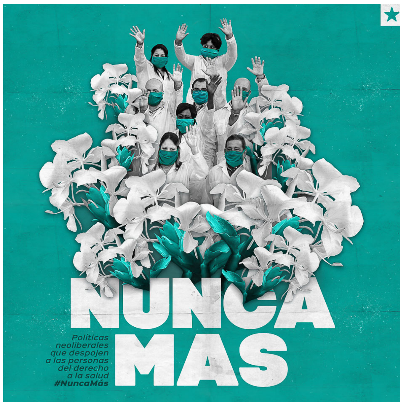
Kalia Venereo (Dominio Cuba), Nunca Más, 2020.