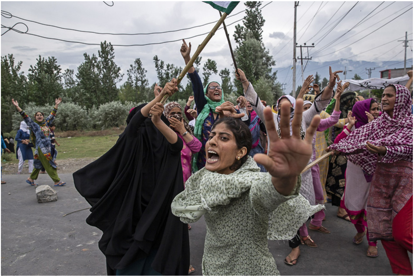
Srinagar, Kashmir, 9 August 2019.