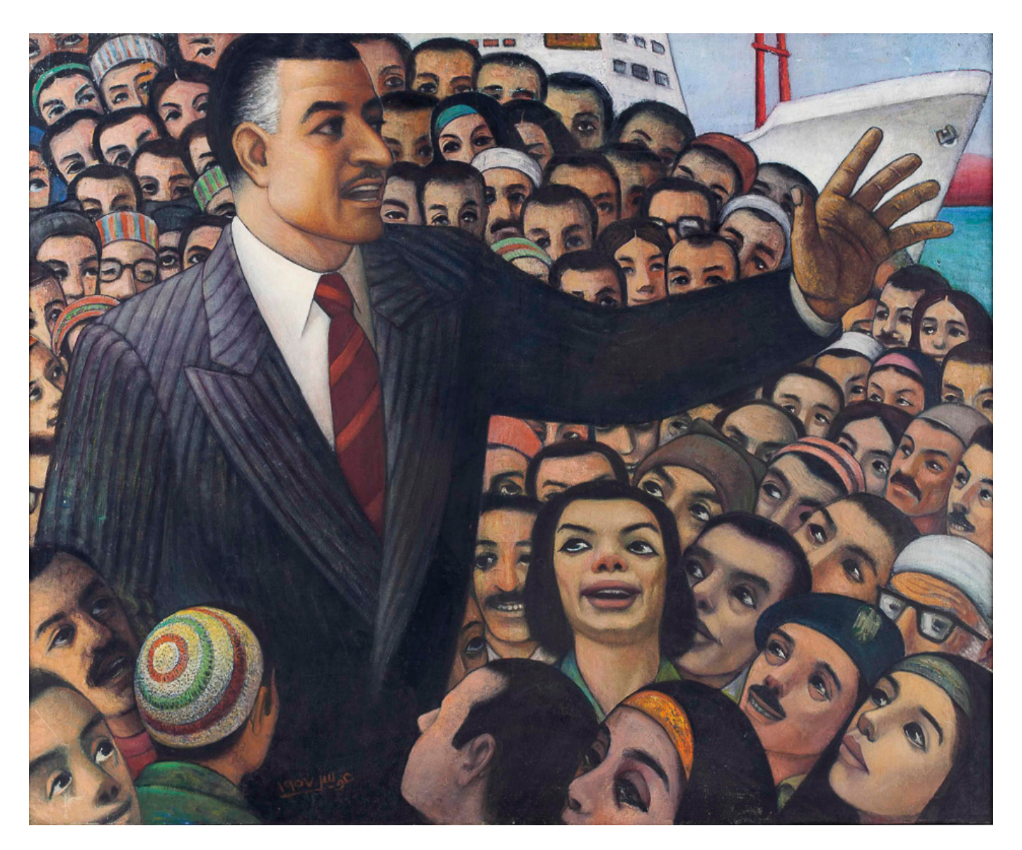
Hamed Ewais (Egypt), The Leader and the Nationalisation of the Canal, 1957.

and it is testing such fanciful weapons as particle-beam weaponry, plasma-based weaponry, and kinetic bombardment. In 2017, Trump announced his government's commitment to such new weaponry. The US government will spend at least $481 billion between 2018 and 2024 to develop new advanced weapons systems, including autonomous vehicles, counter-drones, cyber-weapons, and robotics. The US Army has already tested its Advanced Hypersonic Weapon, which can travel at Mach 5 (roughly 3,800 miles per hour, five times the speed of sound), so that it can reach any place on earth within an hour; this weapon is part of the US military's Conventional Prompt Global Strike program.