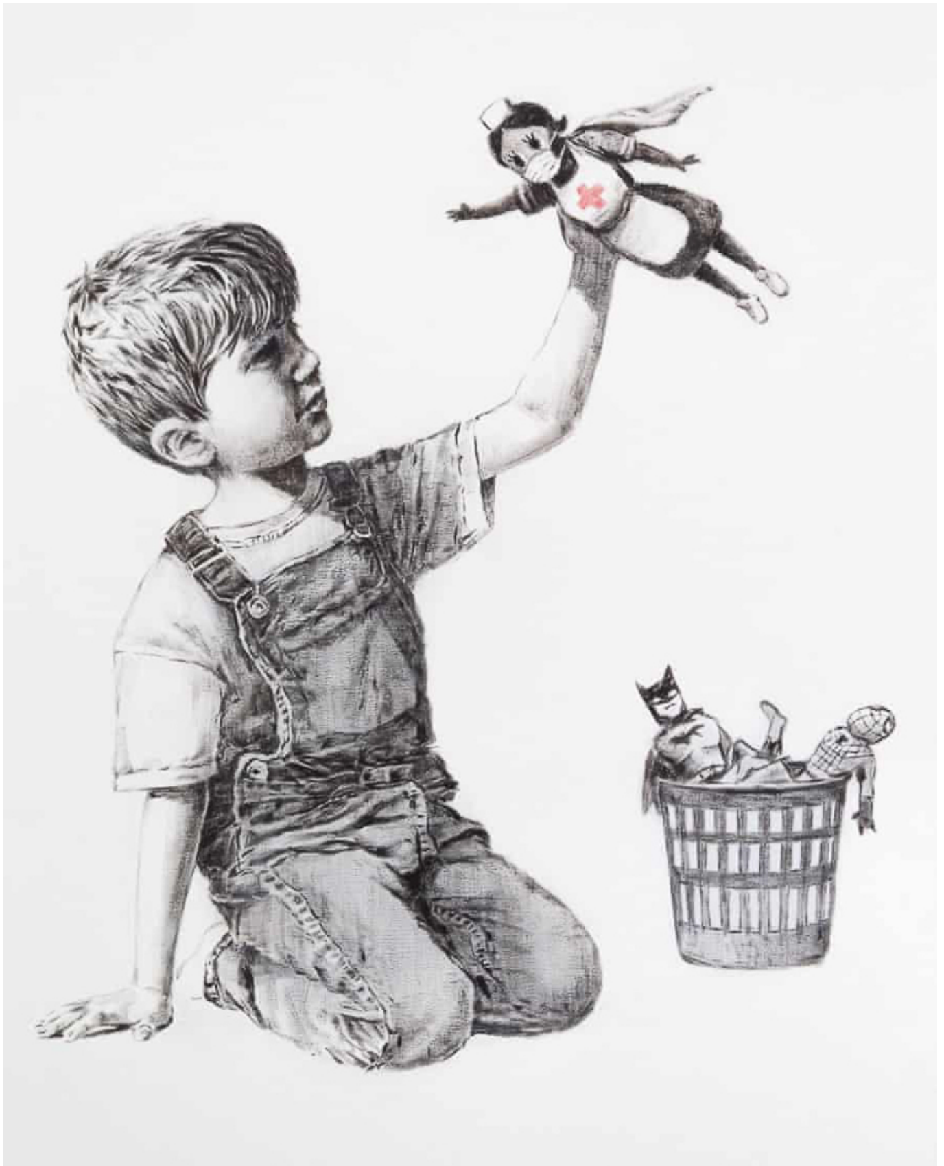
Banksy (unknown), Game Changer, 2020.