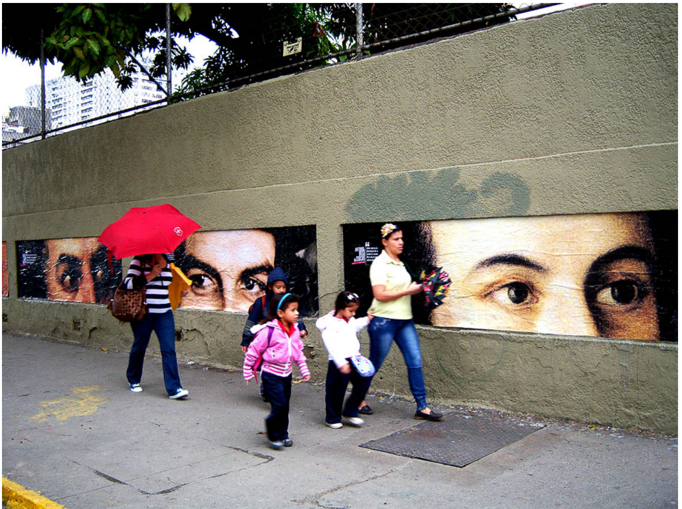
Comando Creativo. History is watching us , Bellas Artes, Caracas, 2011.