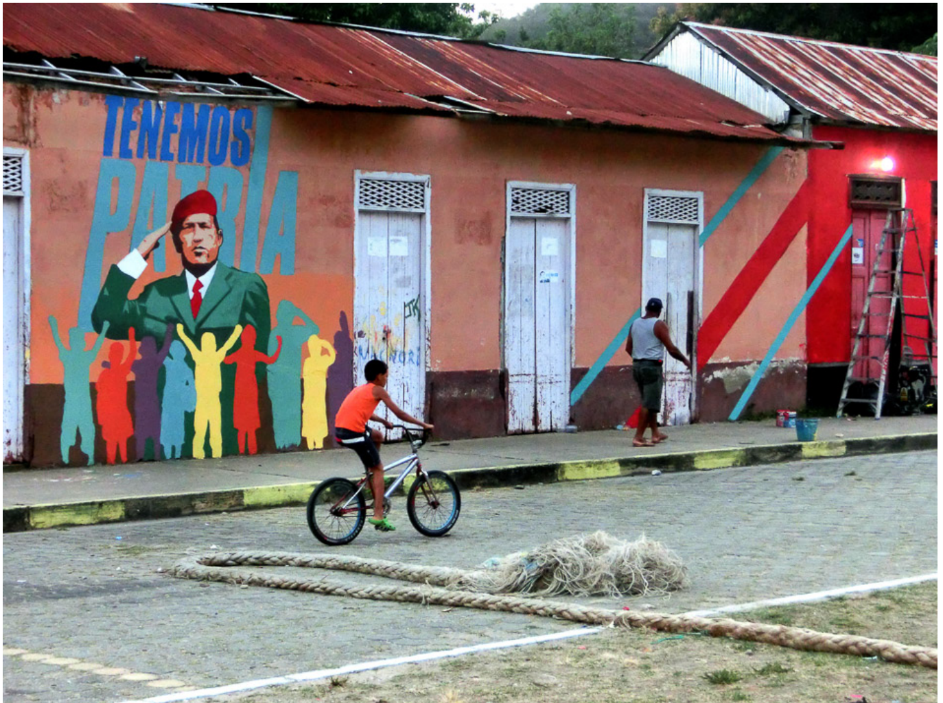
Comando Creativo. Tenemos patria [Temos Pátria] . Macuro, Sucre. 2014

In 2002, the United States – with funds provided by the National Endowment for Democracy and USAID – attempted a coup d'état against Chávez. This coup failed decisively, but it did not stop the shenanigans. In 2004, US Ambassador William Brownfield produced a five-point plan of the embassy: 'the strategy's focus', he writes , 'is 1) strengthening democratic [namely oligarchic] institutions; 2) penetrating [meaning to disorient and buy off] Chavez' political base; 3) dividing Chavismo; 4) protecting vital US business, and 5) isolating Chavez internationally'.