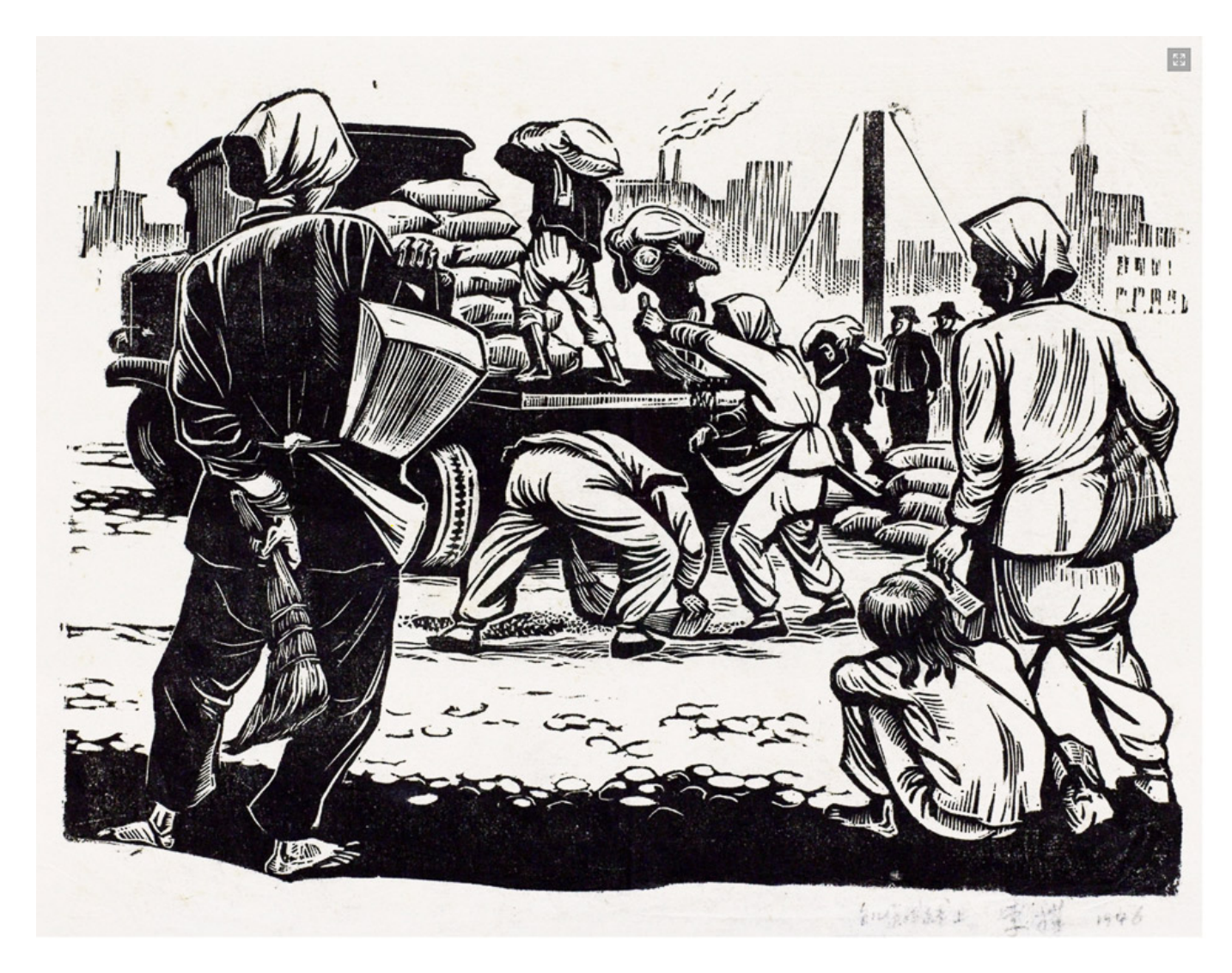
Li Hua (China), Verge of Starvation, 1946.

The debt of these countries is simply not allowing them to properly tackle the three pandemics: coronavirus, unemployment, and hunger.