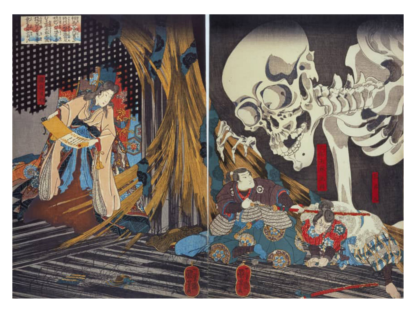
Utagawa Kuniyoshi (Japan), Takiyasha the Witch and the Skeleton Spectre, 1849.