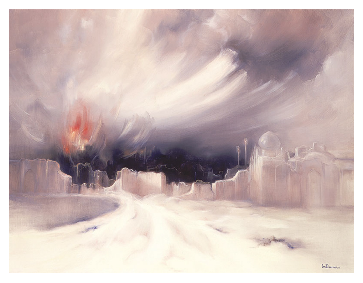
Iran Darroudi (Iran), Steadfastness, 1987.

Here is the essence of it all: colonialism had been defeated, but its structure has remained, with capital now loaned back at usurious rates and debt leveraged as an instrument of political control over the new nations. Old images of enslavement had to be recalled making way for the more anonymous forms of social domination. There is no whip in the hand of the Paris Club (the government creditors) or the London Club (the private creditors), nor in the hands of the International Monetary Fund and the World Bank; but its presence is felt beating down on humankind.