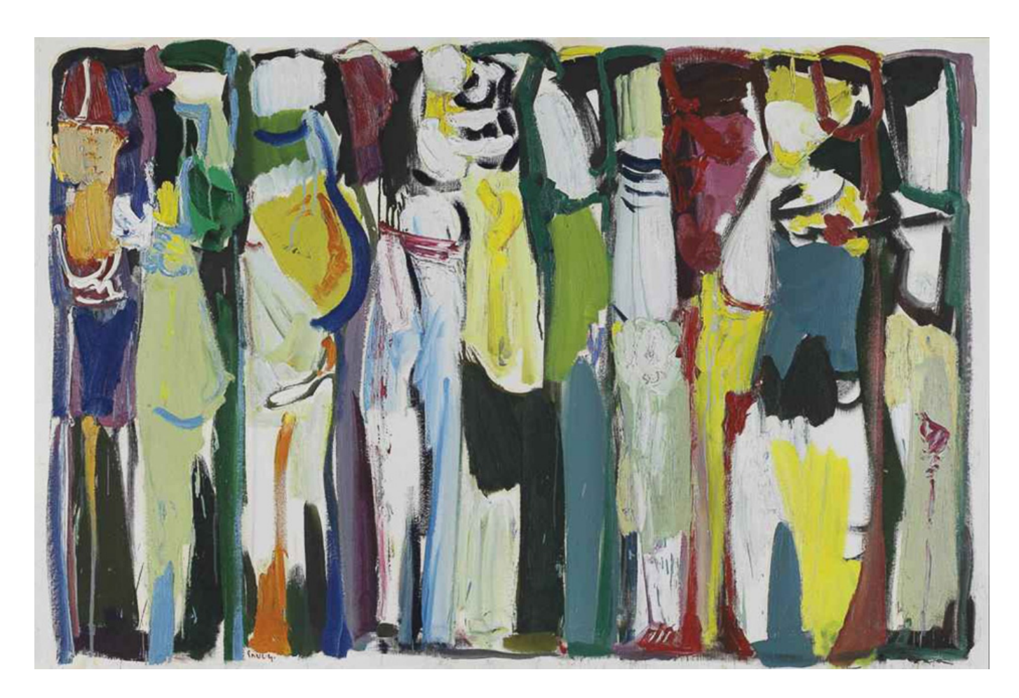
Paul Guiragossian (Lebanon), La Grande Marche (1987).

Ammonium nitrate is a flammable chemical that is used in fertiliser, explosives, and rocket fuel. In 2013, the MV Rhosus, a Moldovan-flagged cargo ship, arrived in Beirut with this cargo; the ship was headed to Beira (Mozambique). Port officials impounded the ship, which was not seaworthy, and impounded what they called the 'dangerous cargo'. Six times between 2014 and 2017, the customs officials asked the judge of urgent matters in Beirut for guidance on how to sell or dispose of the cargo. It is likely that the ammonium nitrate had arrived in the form of Nitroprill, which is a blasting agent used in coal mines. Even a small fire can cause the ammonium nitrate to explode catastrophically. Fireworks were also stored in the same warehouse. More than 19 officials have been arrested, including the director of the Port of Beirut and the customs director. An investigation is underway.