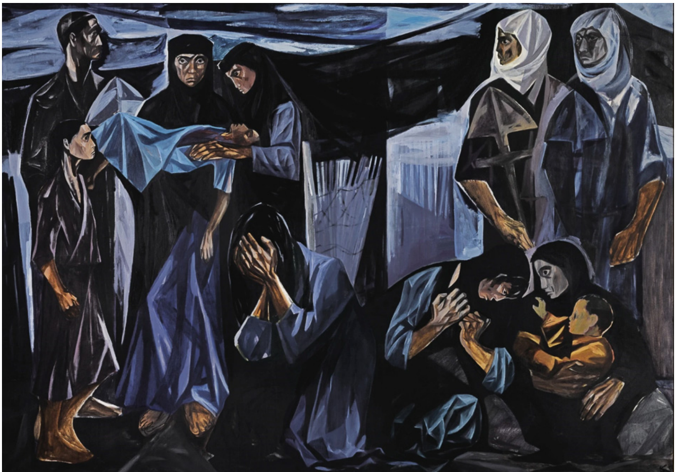
Mahmoud Sabri (Iraq), Death of a Child , 1963.