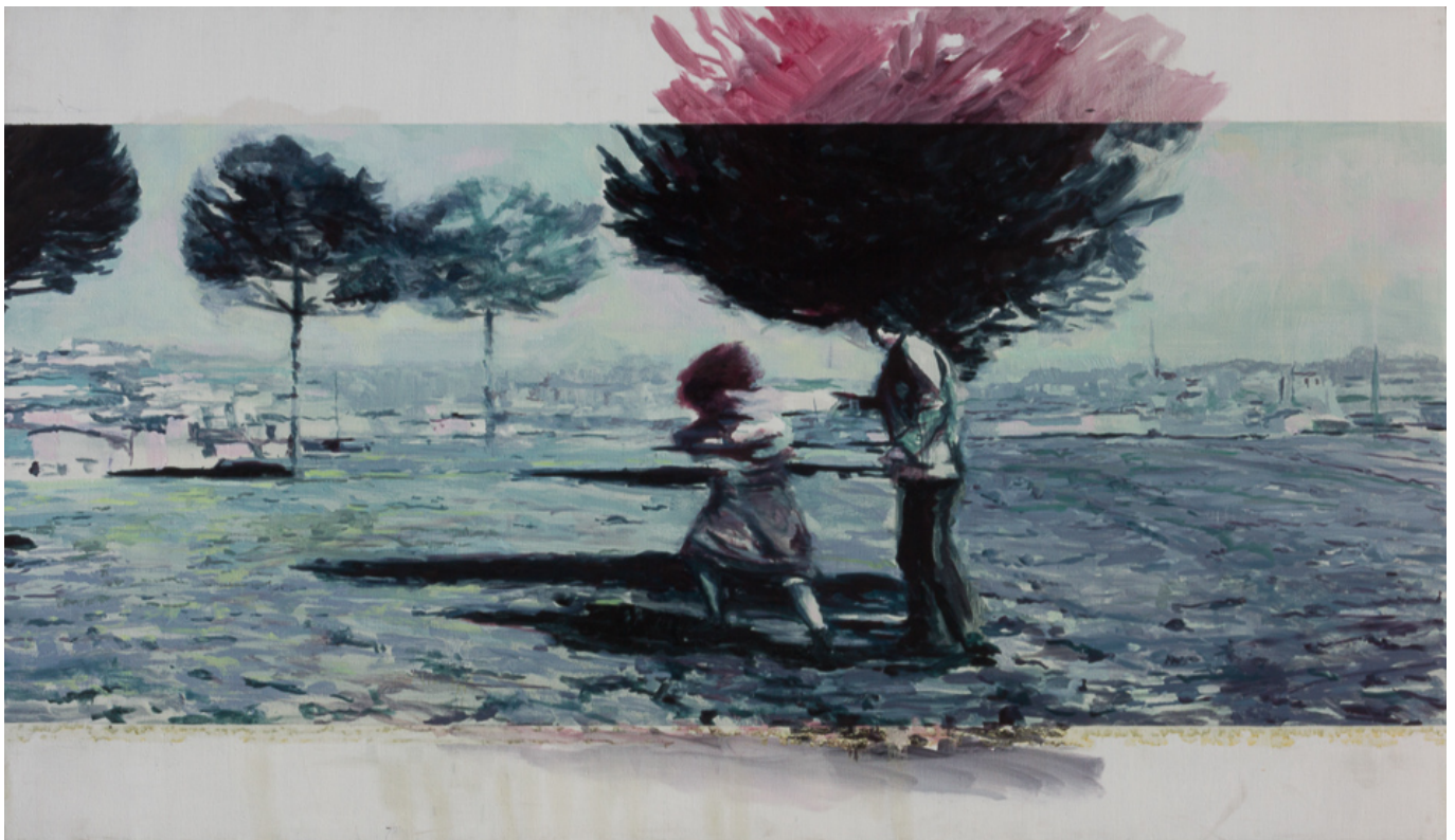
Natalia Babarovic (Chile), The Last Woman on Earth , 2011.

We should all be outraged. But outrage is not a strong enough word.