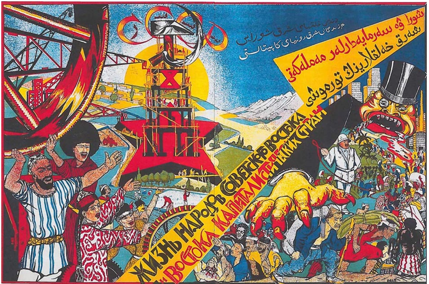
RiaM (USSR), The Life of Peoples of the Soviet and Capitalist East , 1927.

Public health as an idea has a history that goes back through the ages, but early ideas of public health had less concern about the health of the entire public and more about the eradication of disease. If this meant that the poor bore the brunt of it, so be it. This older hierarchical conception of public health remains in our time, particularly in states with bourgeois governments that have a greater commitment to profit than to people. But the socialist idea of public health – that social and state institutions must focus on disease prevention and breaking the chain of infection – grew in force from the 19th century and now comes to the table once more.