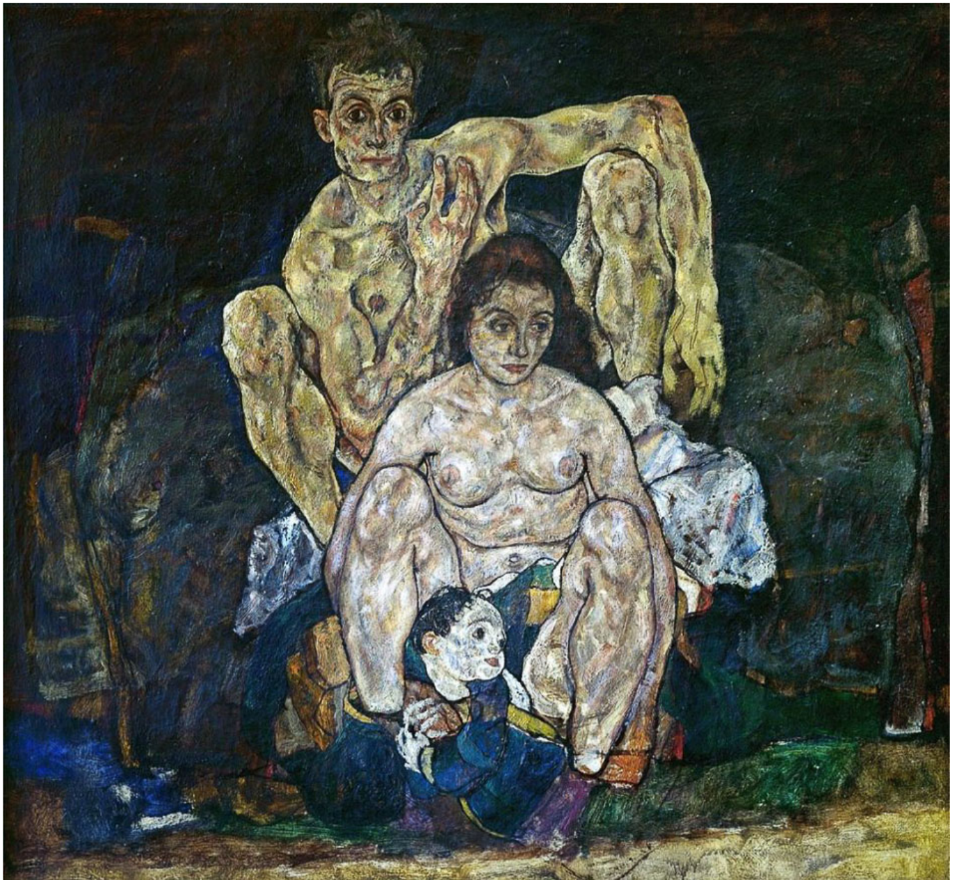
Egon Schiele (Austria), The Family , 1918.

It is welcome news that there are now vaccine candidates from a range of firms and countries, including the two m-RNA vaccines from Pfizer and Moderna, as well as Gamaleya's Sputnik V and Sinovac's CoronaVac. Reports from these and other vaccine candidates show positive results, which raises hope that we will soon have some kind of vaccine against COVID-19. Scientists are wary of the claims made by the private pharmaceutical companies, which have released press statements but have not made the findings of their clinical trials public. Some of these questions include whether the vaccines prevent infection, whether they prevent mortality, whether they prevent transmission, and, finally, what would be the duration of protection.