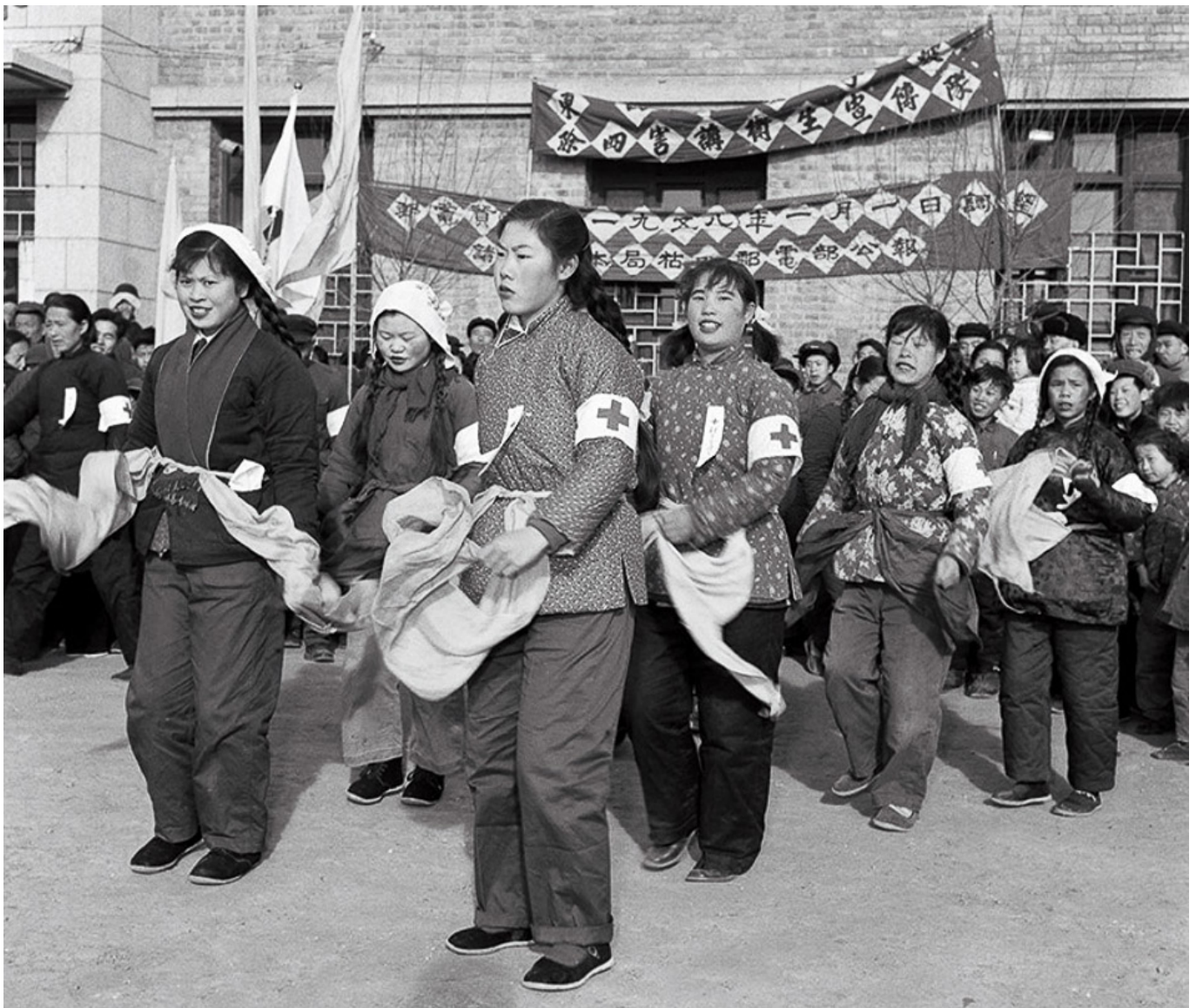
Public Health Elimination Team for the Elimination of 'Four Pests', China, 1958.