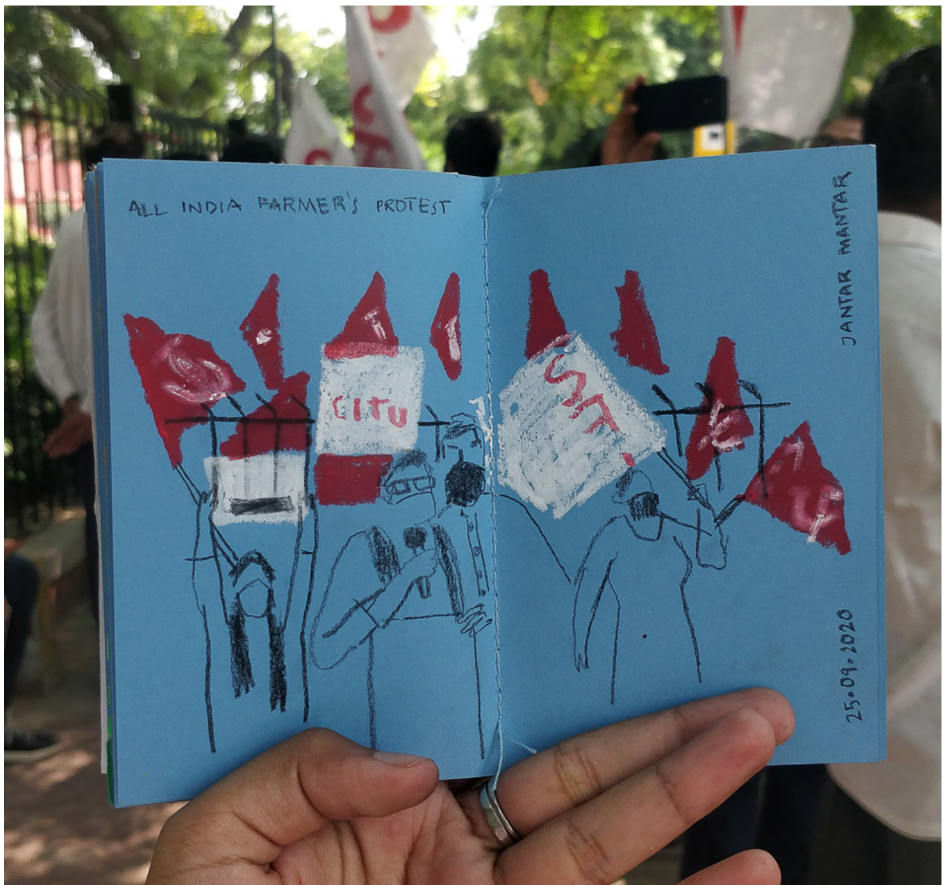
Kruttika Susarla (India), All India Farmers Protest , 2020