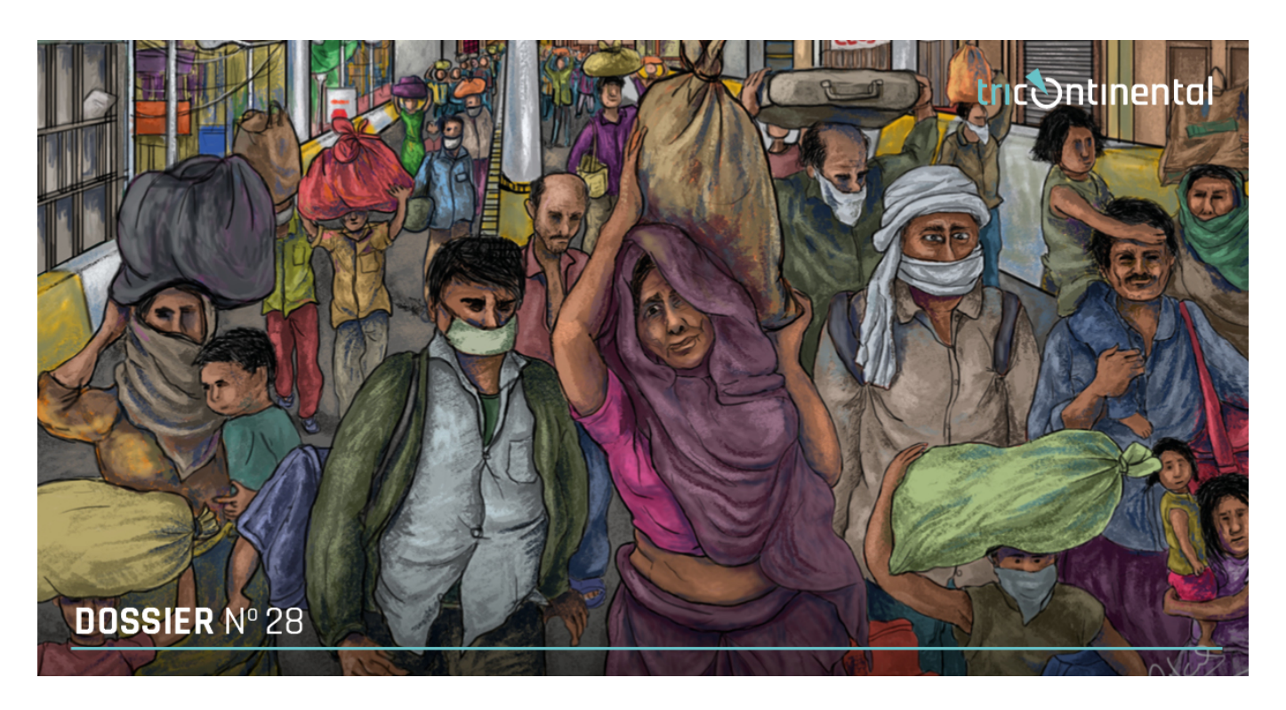
CoronaShock: A Virus and the World. Cover image by Vikas Thakur (India).

Guterres pointed out that the avenues to realise the aims of the Charter are being closed off not only by the neofascists, who he euphemistically calls 'populist approaches', but also by the worst kind of imperialism, as illustrated by the 'vaccine nationalism' driven by countries such as the United States of America. 'It is clear', Guterres said, 'that the way to win the future is through an openness to the world' and not by a 'closing of minds'.