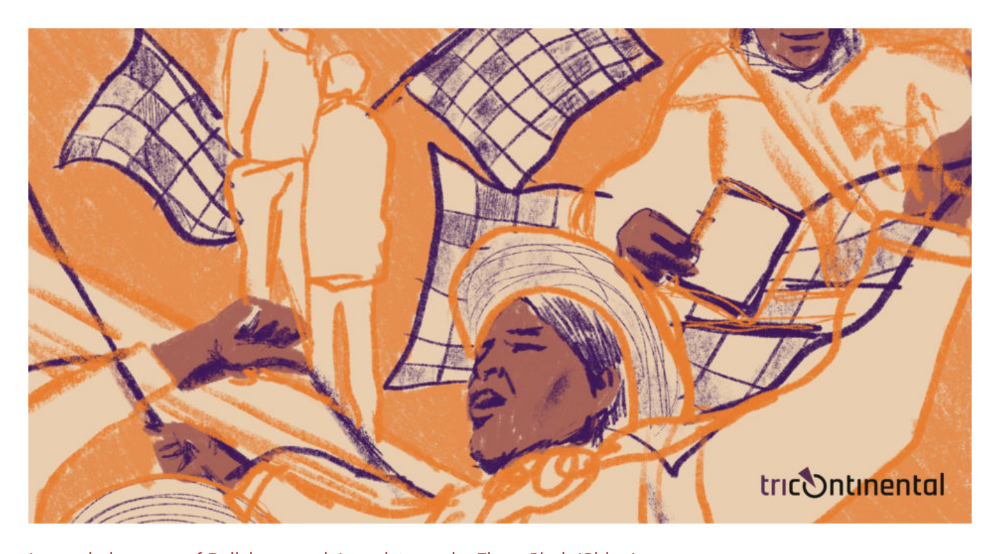
Image in homage of Bolivian people's resistance by Tings Chak (China)