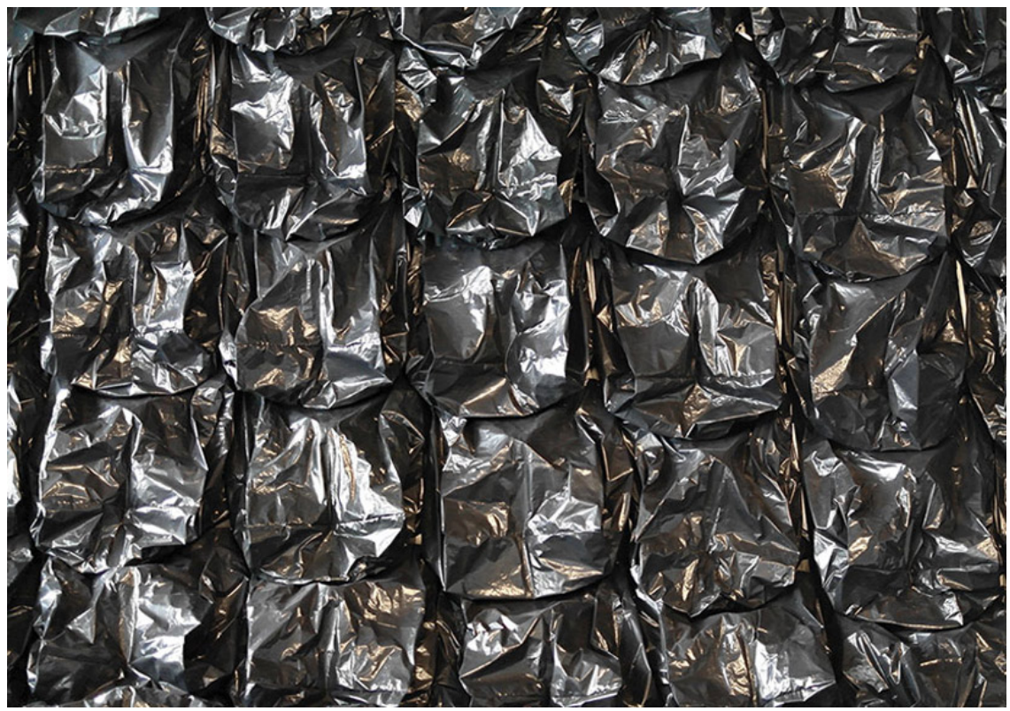
Nils Völker, 88 #2 – an inflatable garbage bag installation. Dear Friends,

Greetings from the desk of the Tricontinental: Institute for Social Research.