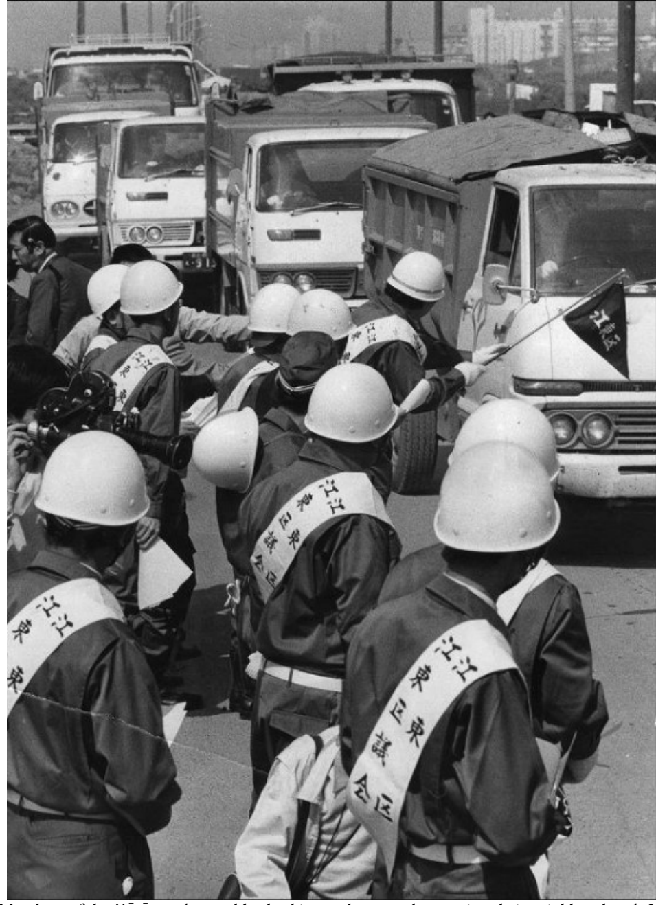
Members of the Kōtō ward assembly checking garbage trucks entering their neighbourhood, 22 May 1973.

recycled, while only 5.5% is composted. Thus, 81% of this trash is discarded in landfills or incinerated. If we continue at our current pace, we will need new planets as landfills.