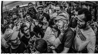
Lula, 7 April 2018.