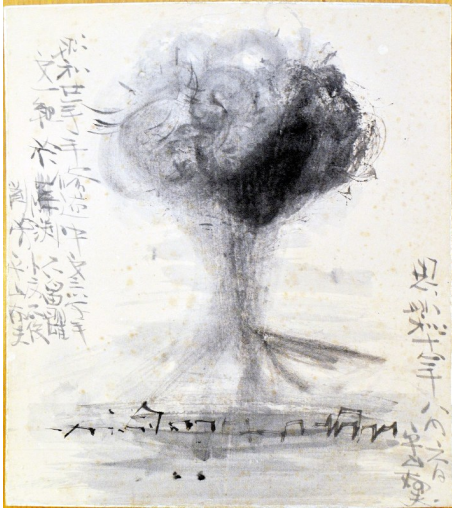
Ikuo Hirayama, Thinking Aug. 6 in the 20th year of Showa