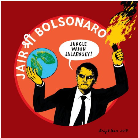
Bolsonaro by Orijit Sen, 2019

Bolsonaro says: We'll Burn the Jungle Right There (an echo of a right-wing slogan in India, We'll Build the Temple Right There, on top of a mosque).