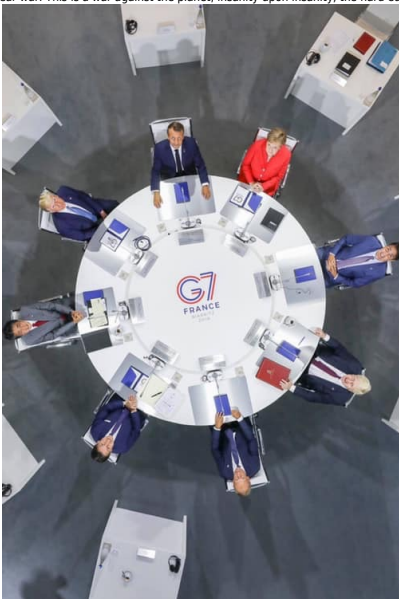
Heads of state of the G7 powers in Biarritz, France

All this only seems acceptable because of the singular power of the military in the modern world. Even though a military dictatorship is seen as improper, civilian leaders lean on the military and on the culture of militarism for their authority. Preventative solutions are scoffed at, while military solutions are seen as realistic. At the 45 th G7 summit at Biarritz (France) a few days ago, the French government invited the Iranian foreign minister Javad Zarif. Only the French met with Zarif, who had come in good faith to negotiate a way out of the standoff in the Gulf. Trump yawned and shared a frat house joke with the UK's Boris Johnson. Diplomacy was shunned. The bombers are ready. Trump wants to speak through them. The heads of government at Biarritz came with stunningly low approval ratings - Boris Johnson unsure if he will last in office for another month, while Justin Trudeau of Canada with poll numbers at the 35% mark. Italy's Giuseppe Conte is already on his way out, while Germany's Angela Merkel will step down in 2021. Between Brexit and the fiasco in Italy, confidence in these people is at a low. Yet, they with a wink they can destroy nations with their bombers and their banks.