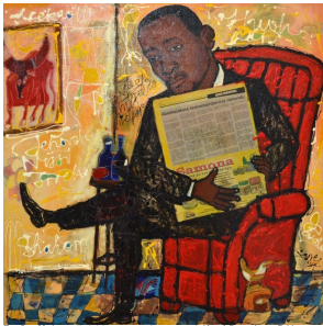
L.S. 2019. Notas: Abolida a tricontinentalidade mundial (Jair Bolsonaro when in Public Place) , 2019.