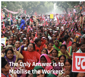
An Interview with K. Hemalata, President of the Centre of Indian Trade Unions.

The way I understand the growth of these neo-authoritarian, these neo-fascists, is that they are not conventional 20 th century fascists. There is something quite different. They actually don't need to destroy the institutions of democracy. They are merely hollowing them out. You still have elections, you still have parliaments, you still have all this stuff. They don't need a dictatorship, because they've hollowed out the concept of democracy. So, it's different from the early 20th century. There is something to learn from that in order to sharpen our analysis, but we need to have an analysis of the concrete conditions of this period.