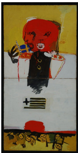
Disavowal, Kikkandini, and signing the return to work of 1962, July 1962.

In the last decade, the term BRICS (Brazil, Russia, India, China, South Africa) has become popular in Brazil. These countries began to articulate themselves and denounce US hegemony in the international scene. Is it possible to say that the election of Bolsonaro, who is in line to Trump, can dismantle this organisation?