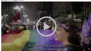
The difference between fascism and neo-fascism

The advancement of the far right in different regions has inspired an interesting debate on the use of the term 'fascism'. There are theorists who say that fascism occurred in Italy in a specific 20 th century context and can't be compared with any other government or regime. Other analysts say that the similarities are so great that it is impossible to call them by any other name. How do you position yourself in this discussion? Should we call them fascism or not? Or should we not worry about these terms now?