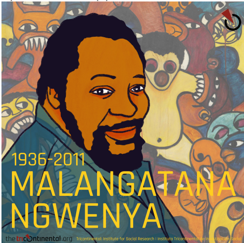
Malangatana Ngwenya, 1936-2011.