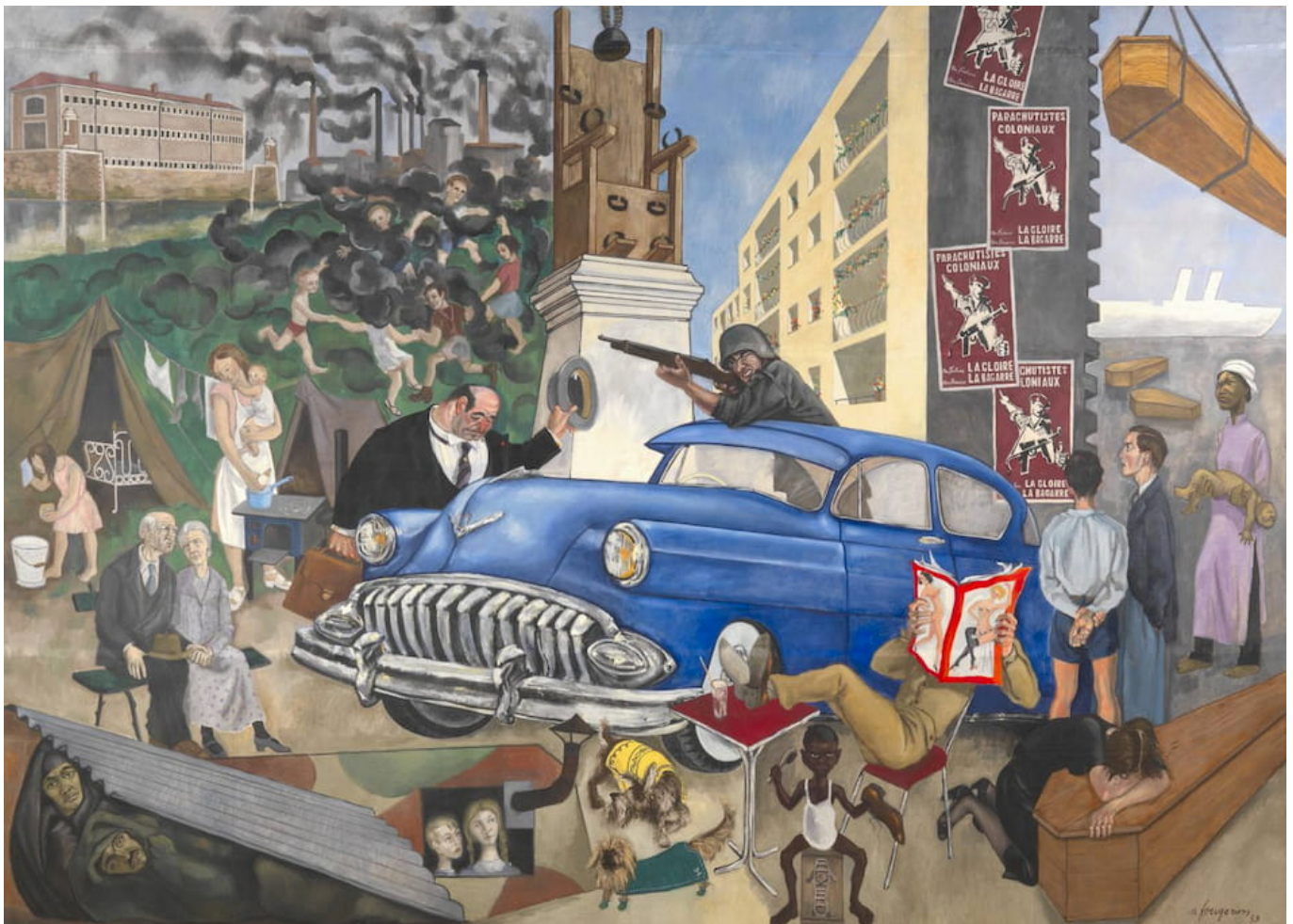
André Fougeron, Civilisation atlantique , 1953

No surprise that young people are on the streets with banners that plead for a new world, for it is these young people who recognise that their lives are at stake, that the class realities of property and privilege are shutting the doors on their aspirations (a new UN report on Chile says that socio-economic inequality is the main grievance of the protestors). This is not a youth uprising without a class character; these young people know that they will not be able to easily access housing and work, joy and fulfilment.