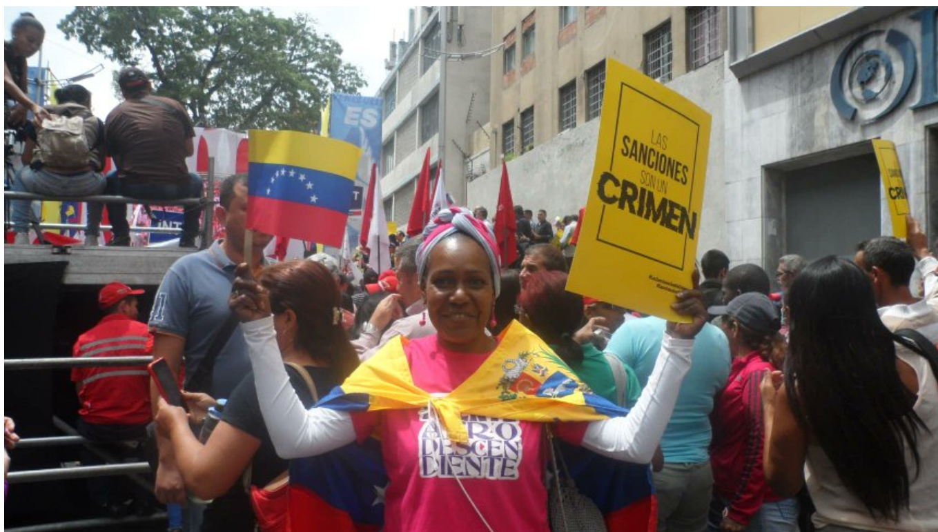
Sanctions are a crime, Caracas, Venezuela, 2020.