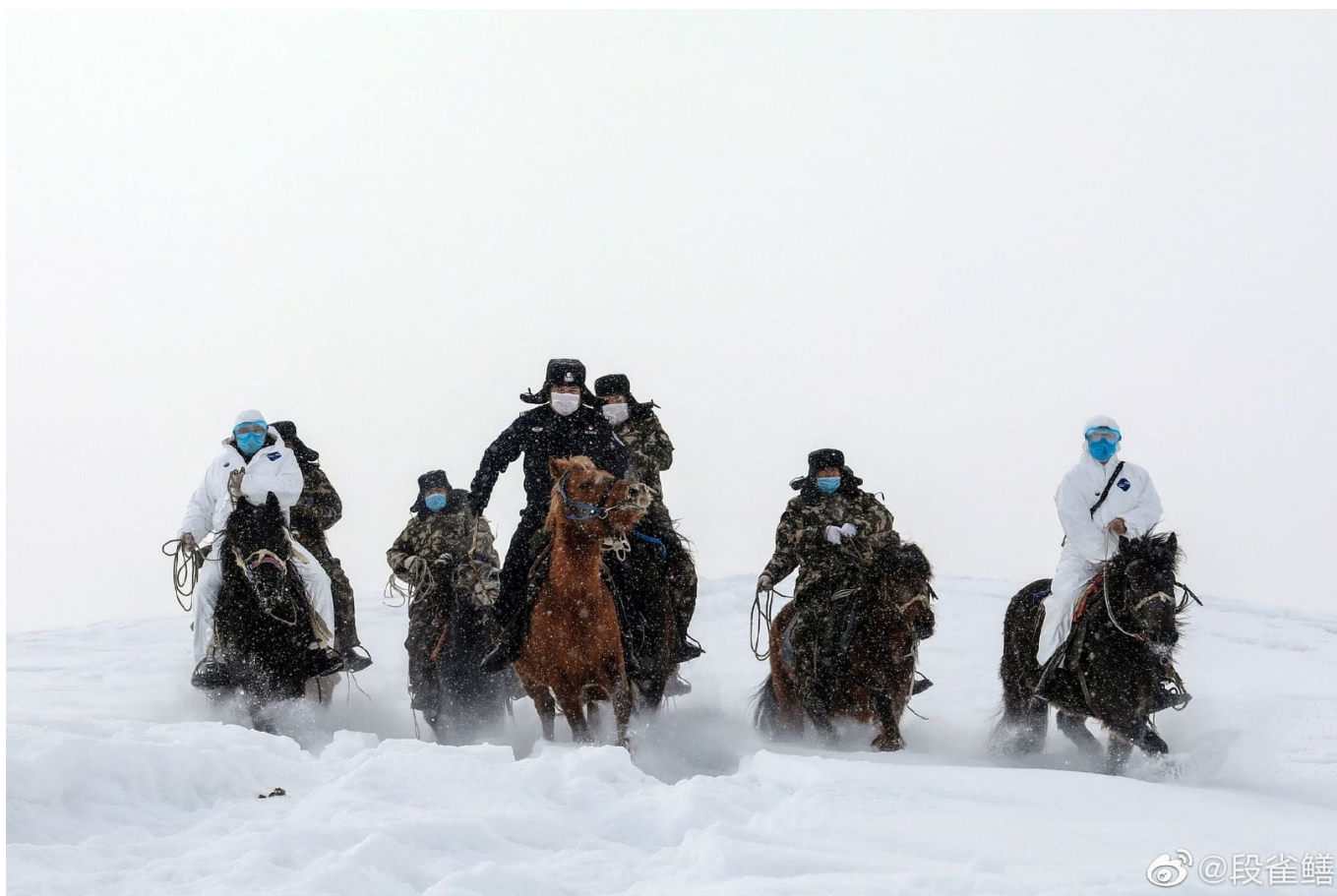
Chinese doctors in the Altai mountains.

Humans have for centuries confronted with great sorrow little understood cataclysmic death, plagues and cholera being the most notable. When the catastrophes strike, it is often women – as nurses, as mothers, and as sisters – who have held society together. Mysterious and mystical explanations have abounded. Science has helped us break through the deep fatalism that has bewildered people; now we seek explanations in the sequencing of genes and in the creation of vaccines. It is belief in reason, science, and solidarity that sent Chinese doctors and nurses to the ends of their country, such as into the Altai Mountains, to heal people and to contain this very dangerous virus that has engulfed us in anxiety and death; it is this that sent them, along with Cuban doctors, to Iran, Iraq, and Italy to assist countries in distress. Their arrival reminds us of a century-long history of socialist doctors and nurses who have thrown themselves into international solidarity for the sake of humanity. These are people who share an ethical landscape with the Indian communist doctors and their people’s polyclinics that we wrote about in Dossier no. 25 (February 2020). This is the socialist tradition.