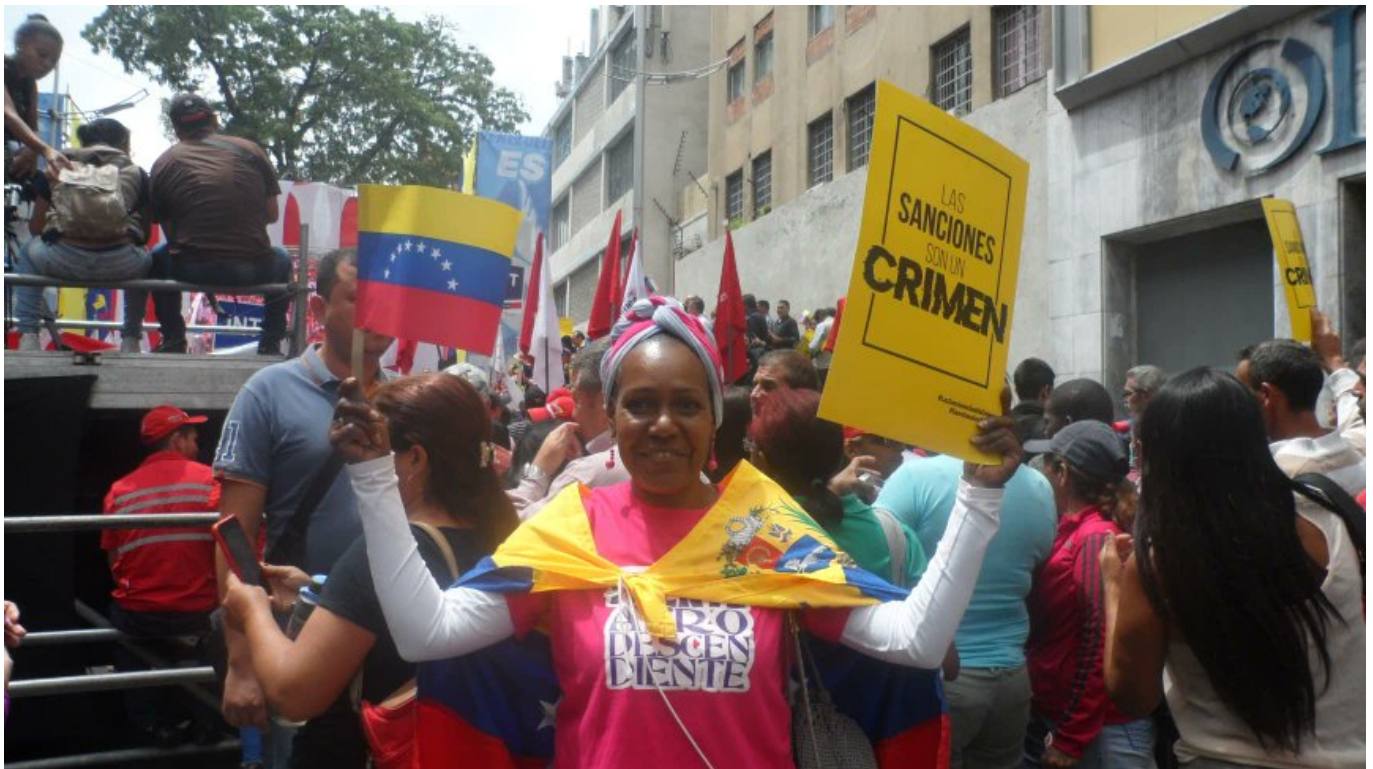
Sanctions are a crime, Caracas, Venezuela, 2020.