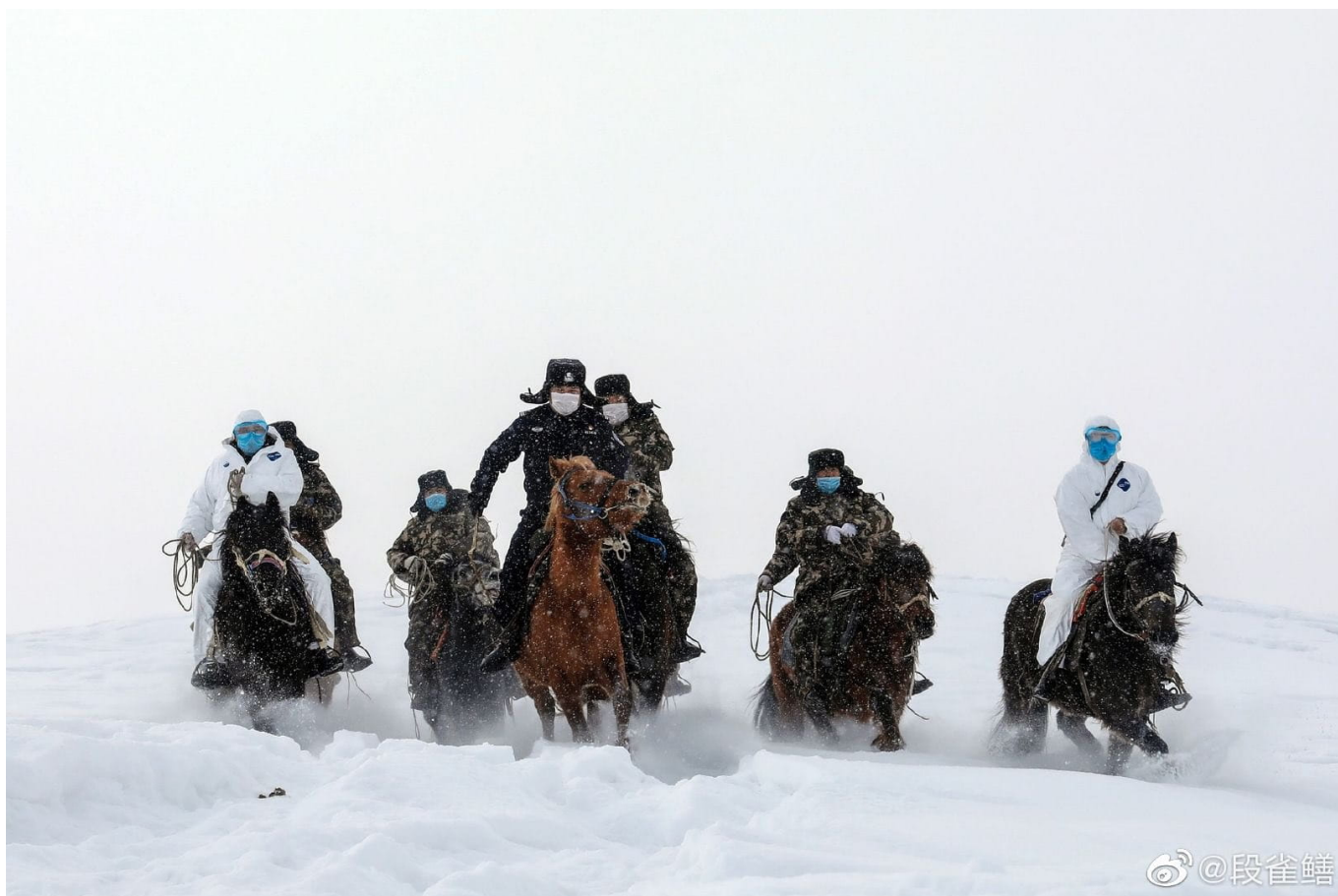
Chinese doctors in the Altai mountains.

Humans have for centuries confronted with great sorrow little understood cataclysmic death, plagues and cholera being the most notable. When the catastrophes strike, it is often women - as nurses, as mothers, and as sisters - who have held society together. Mysterious and mystical explanations have abounded. Science has helped us break through the deep fatalism that has bewildered people; now we seek explanations in the sequencing of genes and in the creation of vaccines. It is belief in reason, science, and solidarity that sent Chinese doctors and nurses to the ends of their country, such as into the Altai Mountains, to heal people and to contain this very dangerous virus that has engulfed us in anxiety and death; it is this that sent them, along with Cuban doctors, to Iran, Iraq, and Italy to assist countries in distress. Their arrival reminds us of a century-long history of socialist doctors and nurses who have thrown themselves into international solidarity for the sake of humanity. These are people who share an ethical landscape with the Indian communist doctors and their people's polyclinics that we wrote about in Dossier no. 25 (February