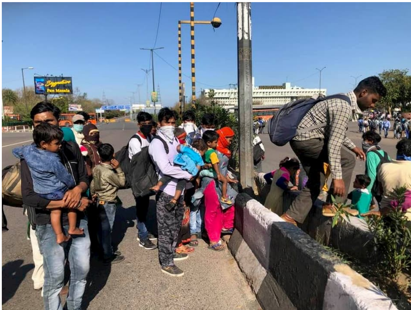
Workers near Kashmere Gate Inter-State Bus Terminal, Delhi, 28 March 2020.