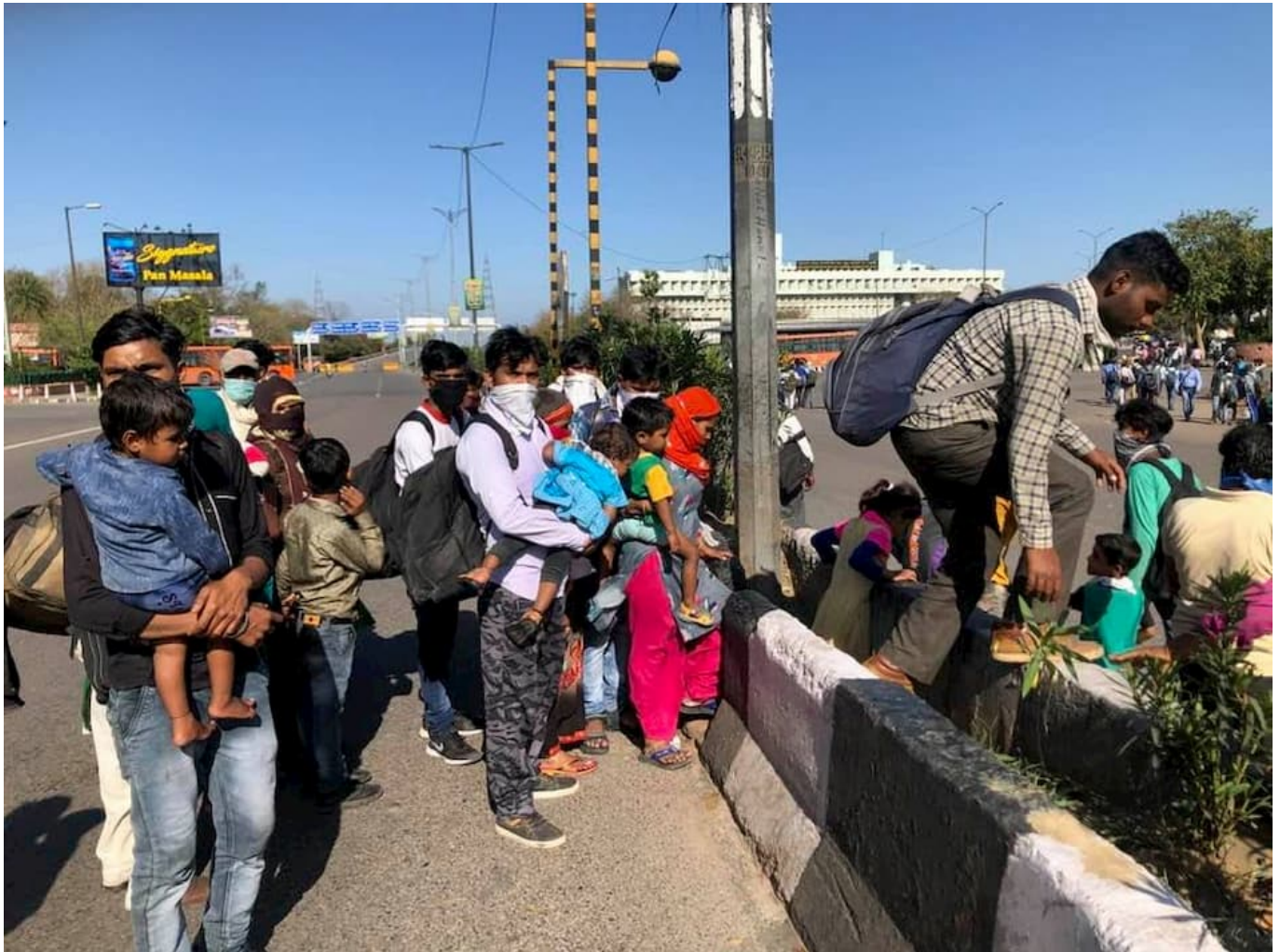
Ram Rahman, Workers near Kashmere Gate Inter-State Bus Terminal, Delhi, 28 March 2020.

The display of disparities condenses at the Anand Vihar bus terminal in Delhi (India), where thousands of factory workers and service sector workers stood cheek-by-jowl as the country closed down. P. Sainath, our Senior Fellow, writes that 'the only transportation now available' to the working class is 'their own feet. Some are cycling home. Several find themselves stranded midway when trains, buses, and vans stop functioning. It's scary, the kind of hell that might break loose if this intensifies. Imagine large groups walking home, from cities in Gujarat to villages in Rajasthan; from Hyderabad to far-flung villages of