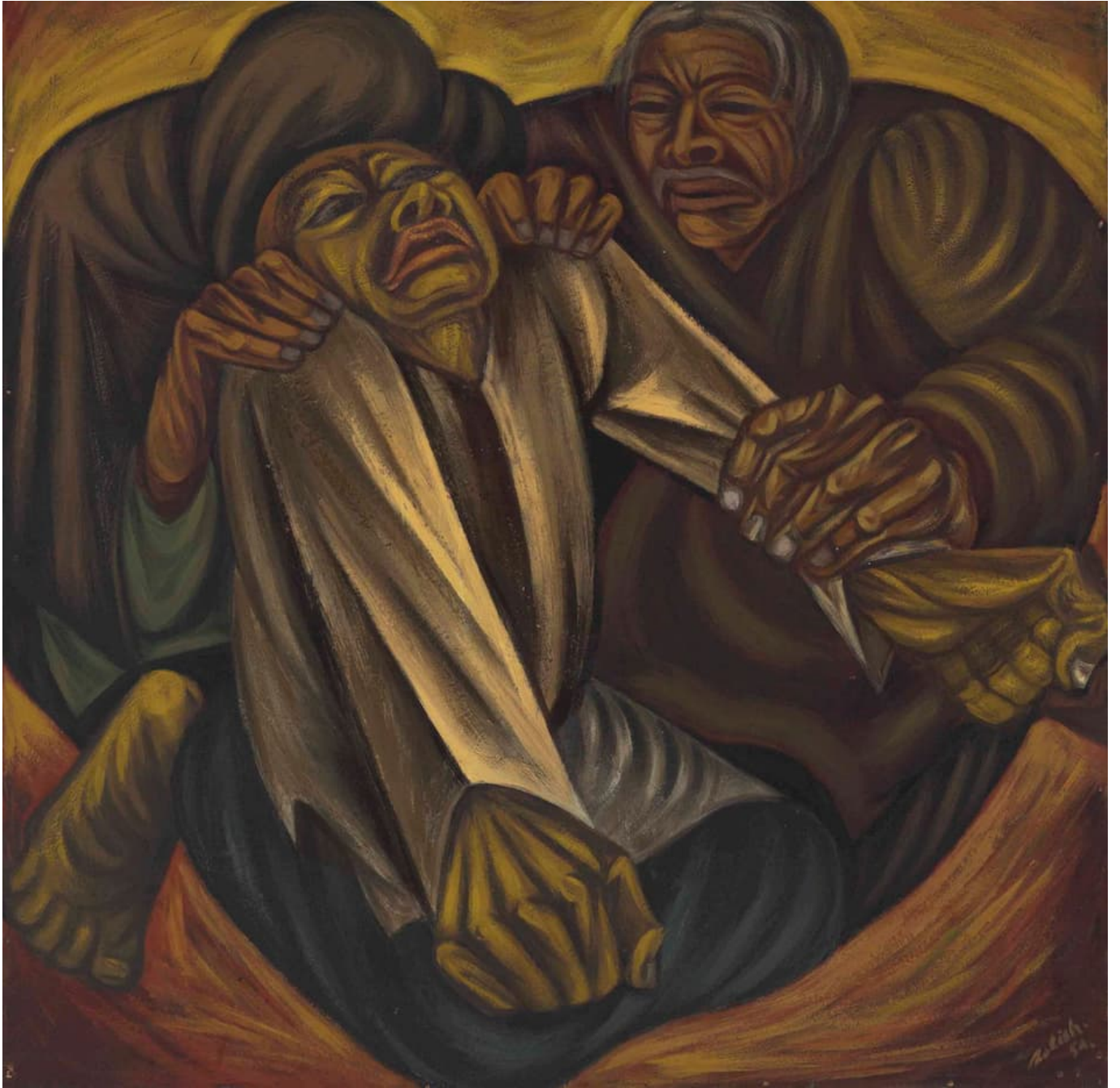
Satish Gujral (1925-2020), The Despair , 1954.

The International Labour Organisation (ILO) estimates that at least 25 million people across