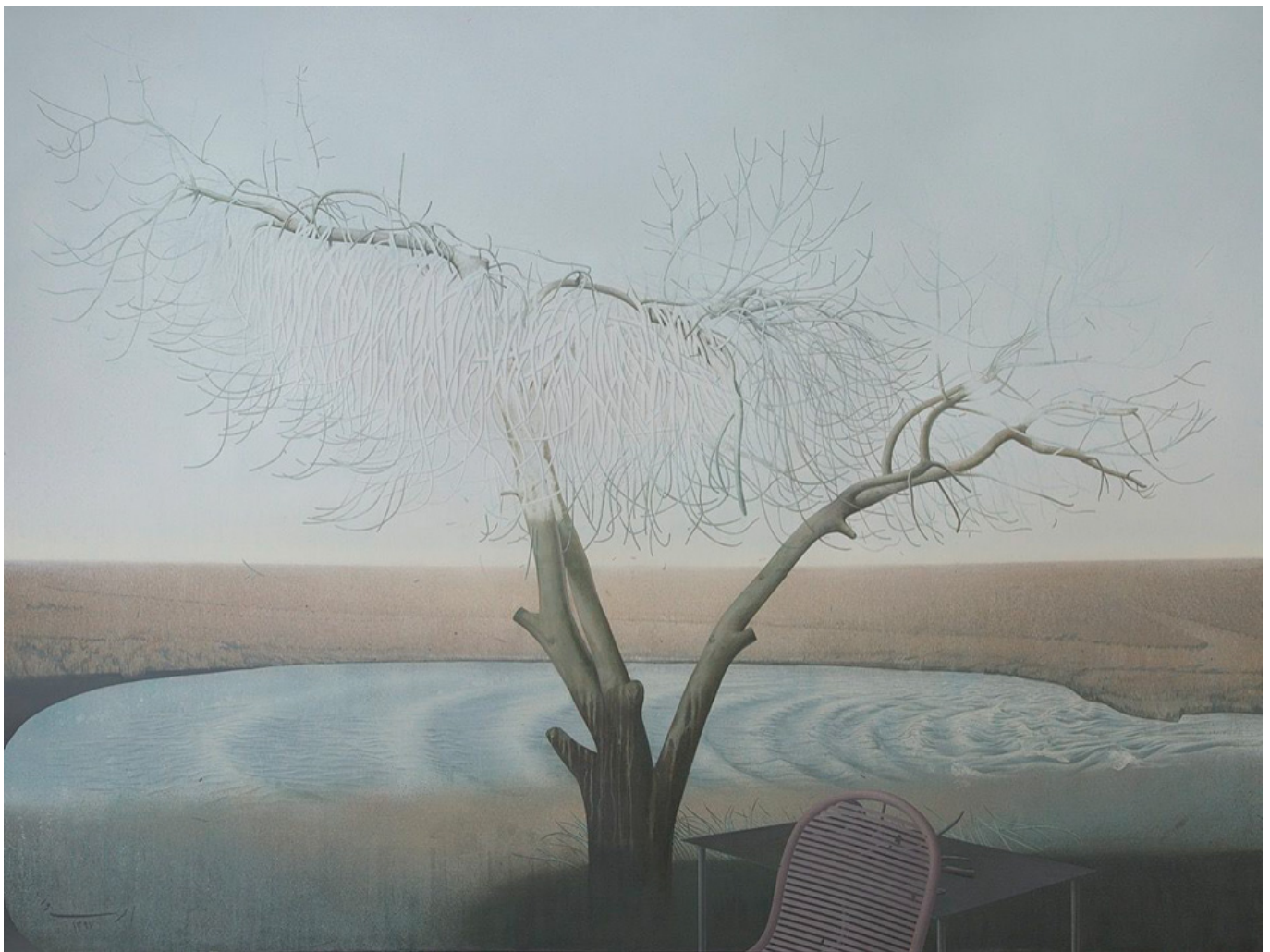
Meghdad Lorpour, Adeshir's Throne , 2018

on Iran. Soleimani's Quds Force went from Lebanon to Afghanistan to build relations with pro-Iranian groups and to encourage and support them in building up militia groups. The war on Syria was a testing ground for these groups. These groups are prepared to strike at US targets if Iran is attacked in any way. After the assassination of Soleimani, the Iranians said that if they were attacked further, they would destroy Dubai (United Arab Emirates) and Haifa (Israel). Iranian short-range missiles can hit Dubai; but it is Hezbollah that will strike Haifa. That means that the United States and its allies will face a full-scale regional guerrilla war if there is any bombing run on Iran. These militias are the deterrent for Iran. That is why Trump hesitated; but he might not hesitate for long.