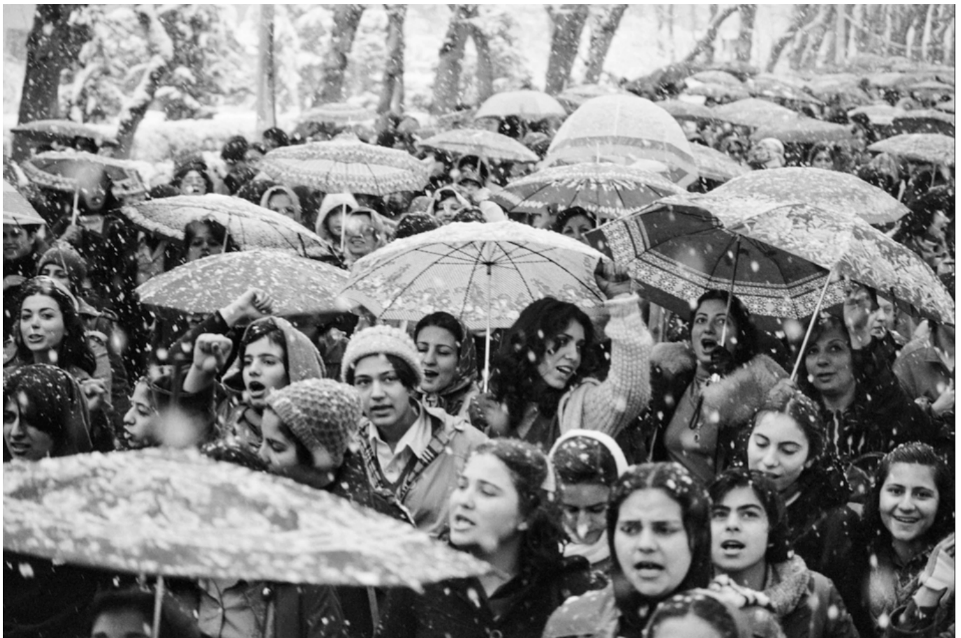
Hangameh Golestan, Witness 1979, 1979