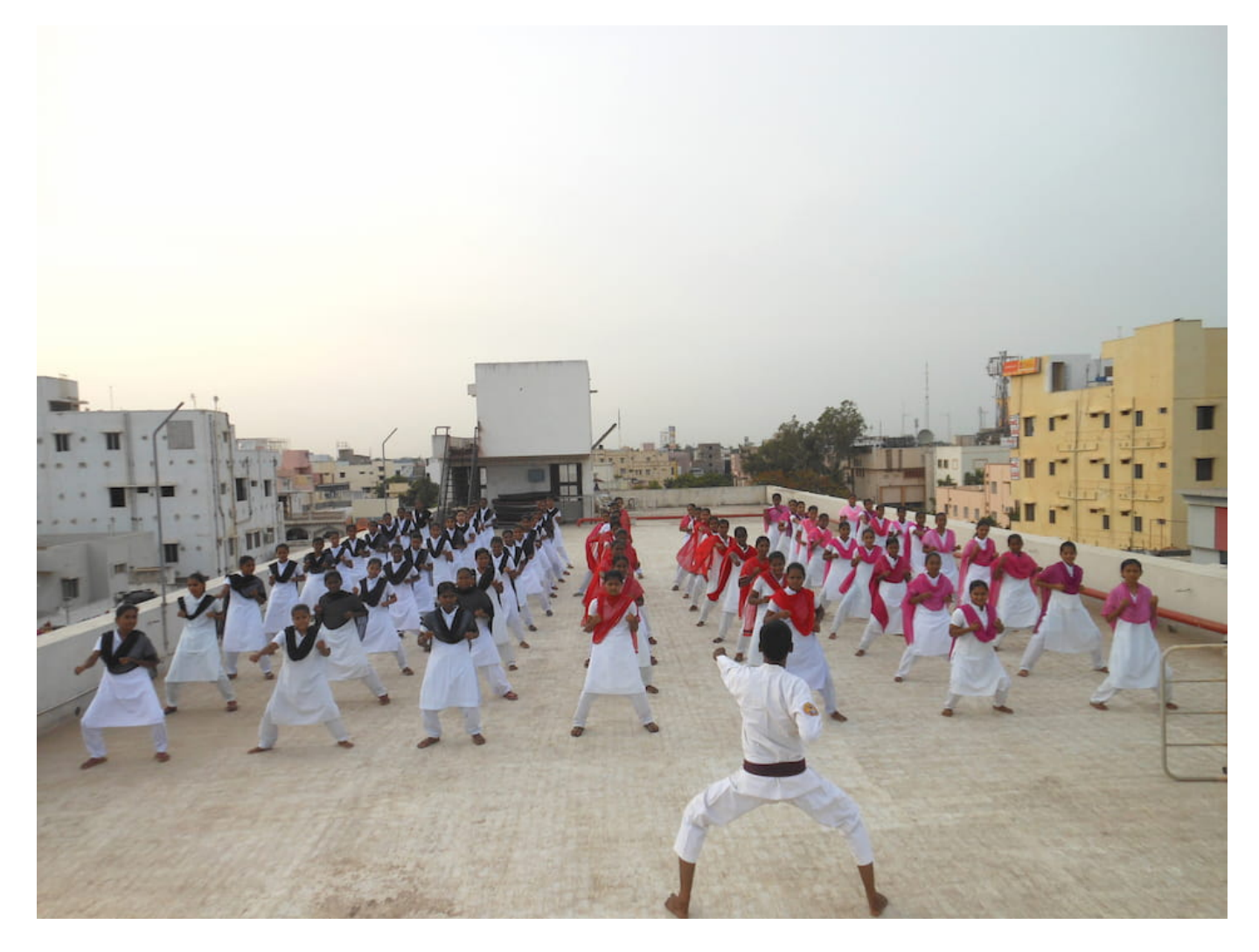
Students of the Dr. P. V. Ramachandra Reddy People's Polyclinic (PPC) Nursing College undergoing karate training.