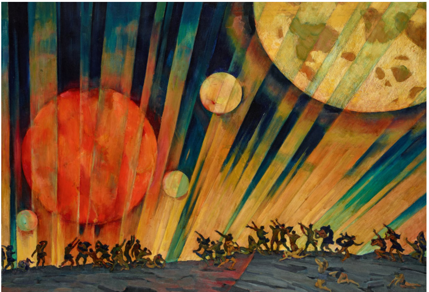
Konstantin Yuon, New Planet , 1921.