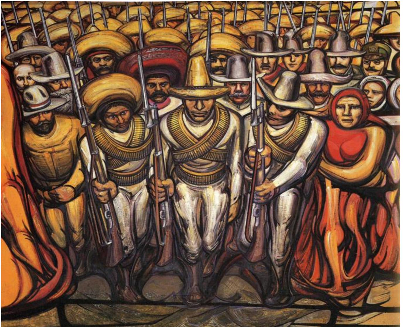
David Alfaro Siqueiros, Del Porfirismo a la Revolución (1957-1966).

On 21 February, thousands of people around the world will gather in public places for Red Books Day , which emerged from three urgencies :