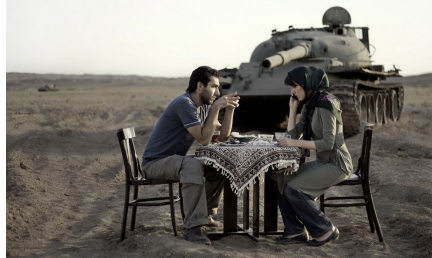
Gabbar Dashti, Today's Life and War , 2008.

Iran – at the behest of the Arab Gulf and the United States – had attacked Iran in 1980, inaugurating a futile war that would go on till 1988. Angry that the Gulf Arabs had not properly financed the war nor honoured the sovereignty of Iraq's oil fields, Iraq's Saddam Hussein attacked Kuwait in August 1990. It is worth recalling that in the summer of 1990, the Gulf Cooperation Council (GCC) – set up out of anxiety for the Iranian Revolution of 1979 – hastened to normalize relations with Iran. Kuwait resumed flights to Iran and linked investment and shipping deals with Iran. The GCC, which had egged Saddam to attack Iran, now seemed to curry favour with Iran against Iraq. The blood of Iraqis and Iranians stained the long border between those two countries; the people of both countries had been treated as pliable marionettes by the Gulf Arabs and the West. Iraq's invasion of Kuwait started the Gulf War, which does not seem to have ended. Today, the Gulf War manifests itself in the fierce siege against Iran.