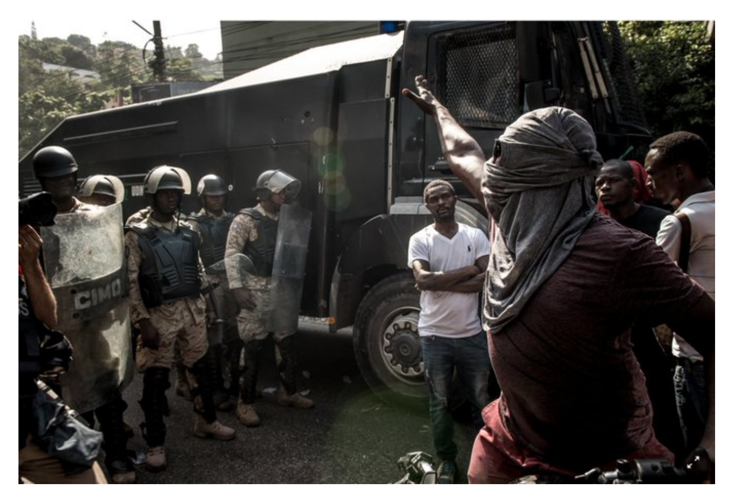
Port-au-Prince (Haiti), October 2019.

It is important to ask why people have taken to the streets, to ask about their political orientation. In each of these cases – Chile, Ecuador, Haiti, and Lebanon – the core issue is that the people of these countries have been defrauded by their own bourgeoisie and by external forces (pointedly, multinational corporations). The protests have targeted their governments, but that is only because these are protests that want to uphold democracy against capitalism. These protests could go deeper, or they could fizzle out. These are the main choices.