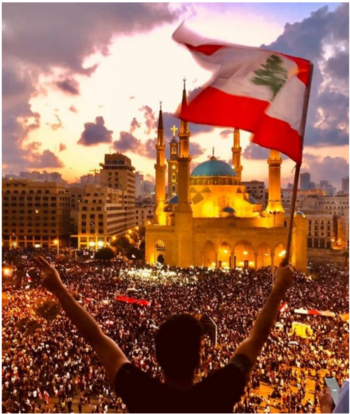
Beirut (Lebanon), October 2019.

- its Gini coefficient sits at 0.50 (midway between complete equality and complete inequality). The richest 10% in the country earn an income that is more than 26 times that of the poorest 10%. If you add in the wealth of the richest 10%, the gap is even more dramatic. Chile's tax system is notoriously regressive, with corruption legalised through the tax code. The government has raised the fees to the Santiago metro (used by three million people – a sixth of the country) over twenty times since 2007; if you buy two rides a day, the fee absorbs 16% of your income). On 14 October, frustrated middle school students began a protest that targeted the fee increases and, more broadly, Chile's structural corruption.