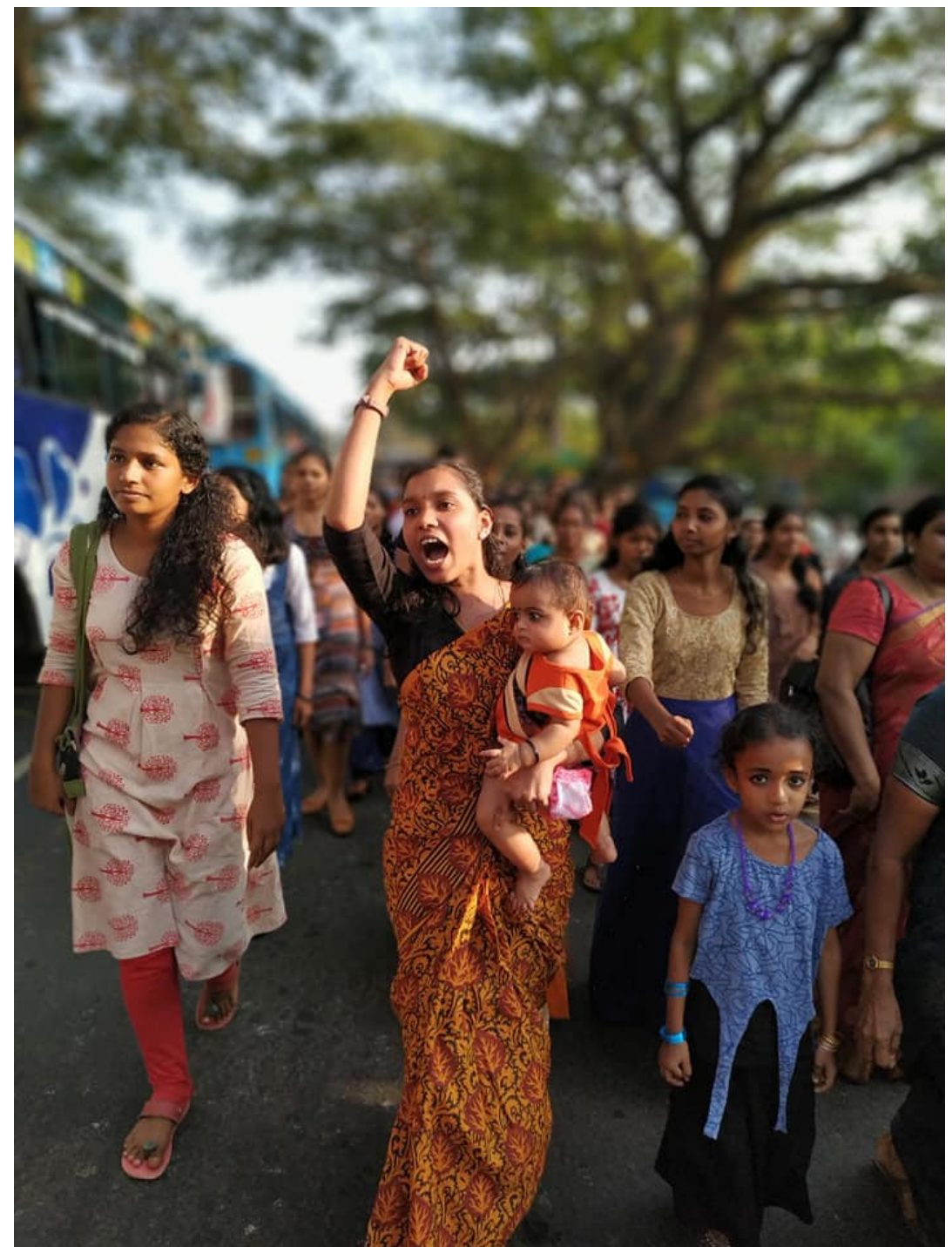
Kerala, 2019.

We are sorry for the inconvenience, but this is a Revolution: The First Newsletter (2019)