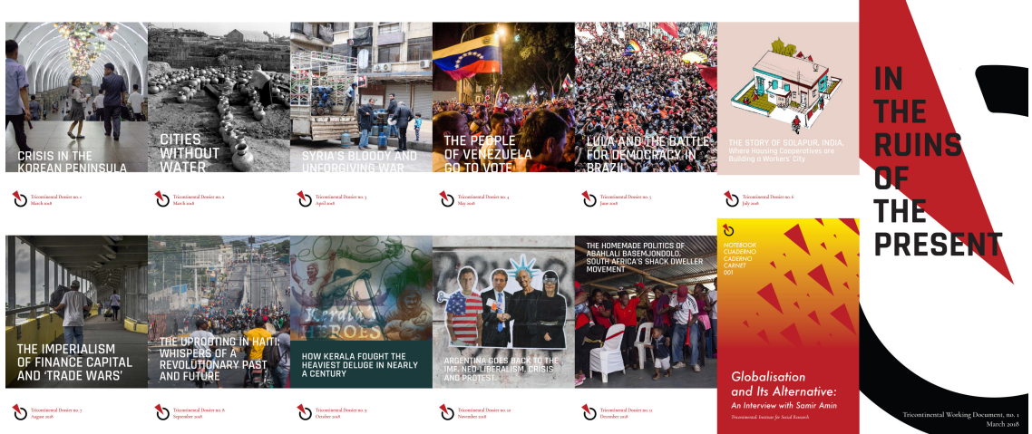
Images from the world of the Tricontinental: Institute for Social Research .