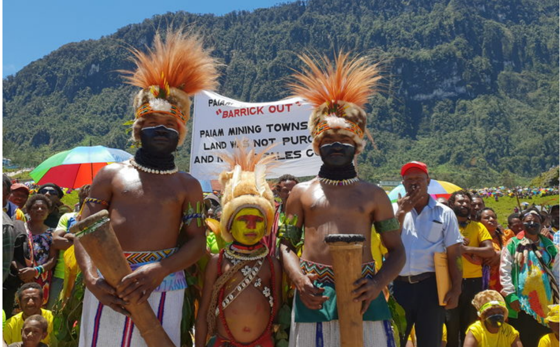
Protest at the Porgera Gold Mine, 2018.

Weep weep let us weep. We thought it was merely a stone We thought it was merely a stone But it carried away our wealth.