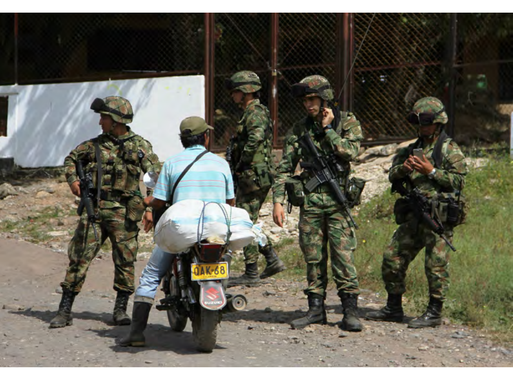
Filo Gringo Village, North Santander, Colombia. Region of Catatumbo.

The high level of militarisation has not resulted in peace or security for the communities that live there. A study by Indepaz Foundation (2019) finds that the most violent municipalities are in the regions of Catatumbo, Cauca and Arauca, which have the highest concentration of soldiers and which pose the greatest risk to the lives of popular leaders of the peasants, indigenous communities and Afro-Colombians. This is where popular leaders are being assassinated at the