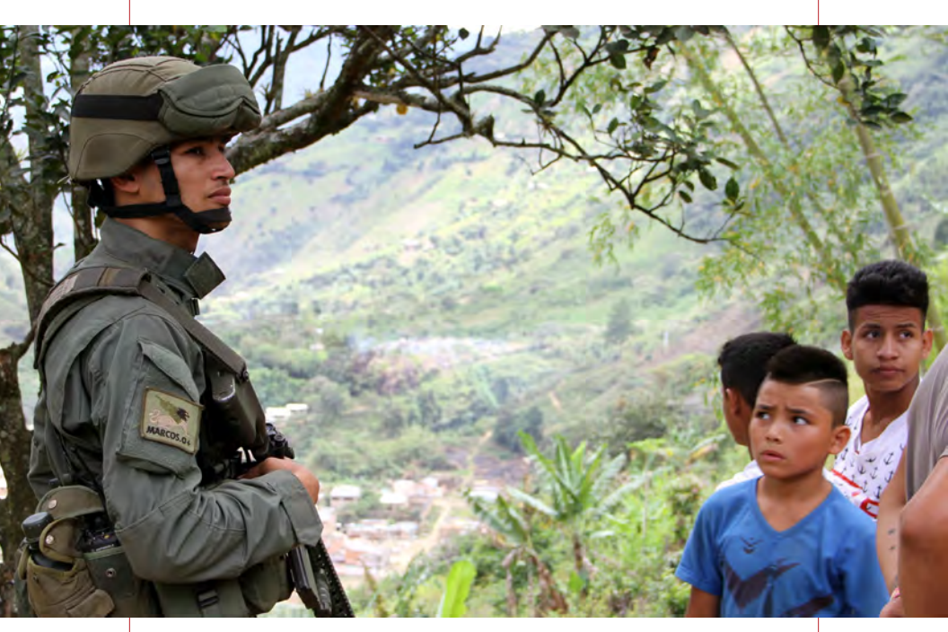
El Mango Village in the town of Argelia, Department of Cauca, Colombia.