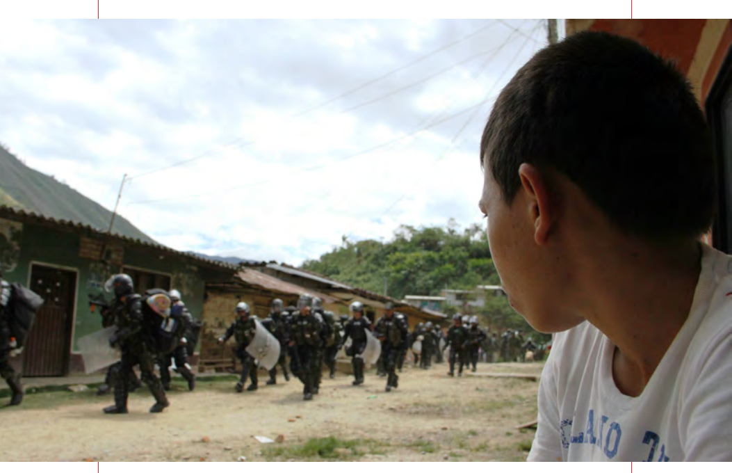
El Mango Village in the town of Argelia, Department of Cauca, Colombia.